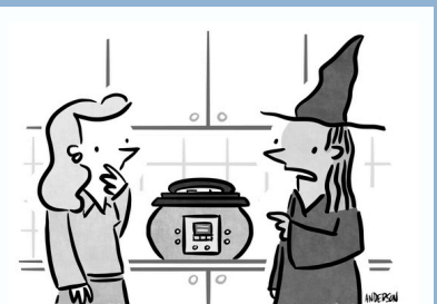
"It's one of those new Instant Cauldrons. You put a kid in here with some eye of newt and an hour later it's the best thing you've ever eaten."